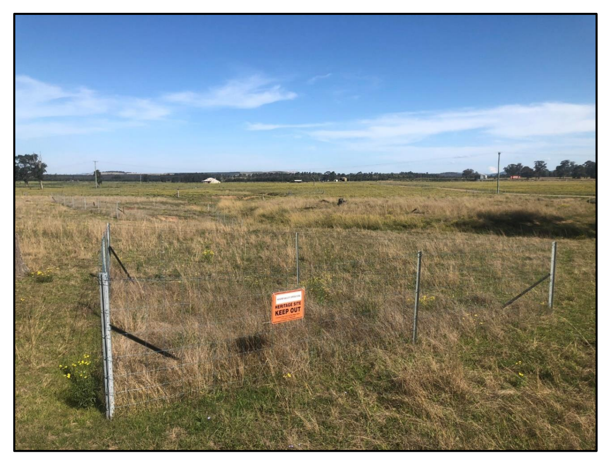
Example of new HVO ACH site fencing technique

210520_HVO_2107_South_21H1_AHMP_Compliance_Audit_Report