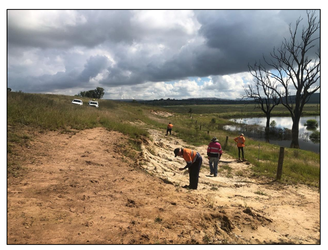
Severe erosion in the vicinity of ACH sites HVO-1675, 76, 86, 87, 88

It should be noted that the new and upgraded ACH site fencing specification being trialled and installed at several ACH sites across HVO has been received positively by CHWG members and is considered the favoured option when site protection is warranted. In this instance, two fences should be installed – one around HVO-1685 and a more extensive fence surrounding the remaining sites.