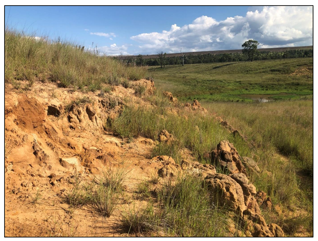
Severe erosion in the vicinity of ACH sites HVO-1682 and 1683