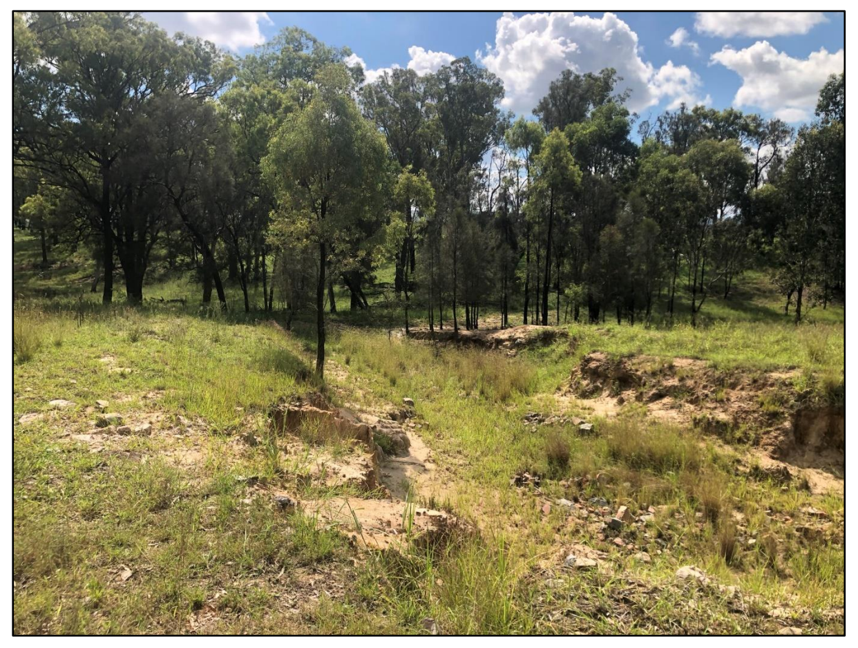
Damaged spillway in the vicinity of ACH sites HVO-1653, 1654 and 1655

Due to the risk of further disturbance to these sites it was recommended by the CHWG representatives that they be salvaged. An AHIP is not required to implement this measure, as the salvage of these sites, with Aboriginal community participation, is authorised under the HVO South AHMP.