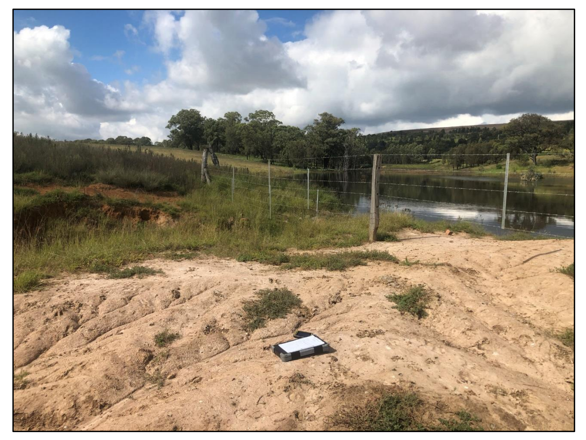
Erosion in the vicinity of ACH site HVO-1685